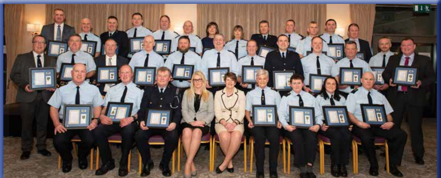
21 Year Group