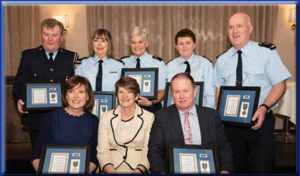
30 Year Group